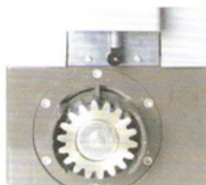
Integrated limit-switch in opening and closing