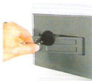
Simple unlocking system by key