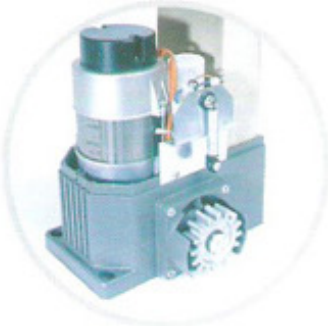
Metal body and highly sturdy components.