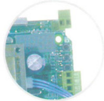
All control boards included in the RR range can be easily programmed through display