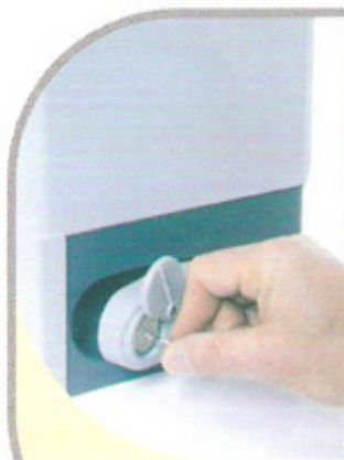
Simple unlocking system by key.